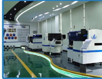
Global fastest machine, 250000CPH New world record.