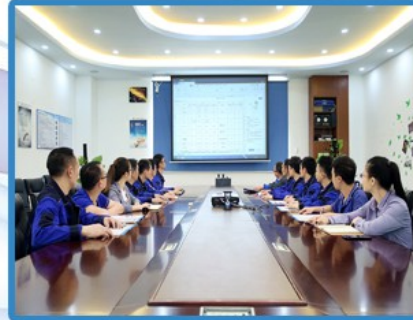
China Top brand, leading manufacturer of SMT machine.