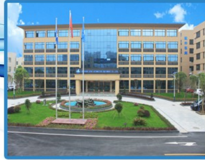
50000m 2 factory, 45000m 2 production workshop.