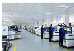
strict machine testing