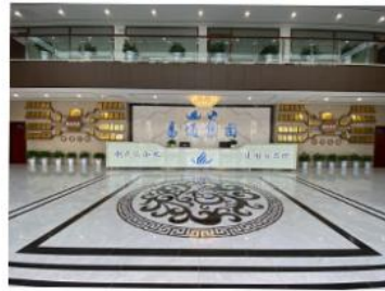
The hall of office building in jiangxi