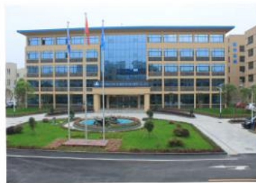
more than 300 employees