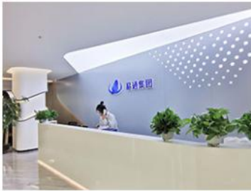
The hall of office building in shenzhen