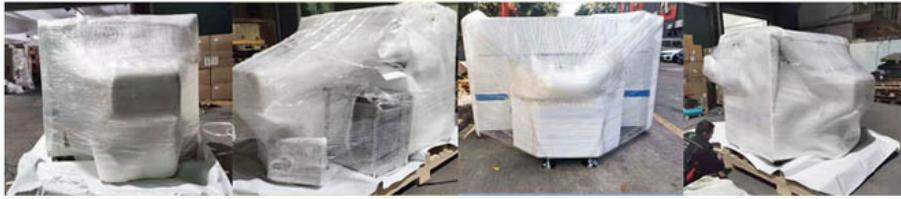
Step one: Pack the machine with foam cotton and stretch film to protect the outside of the machine