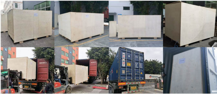
step three: professional wooden box packaging