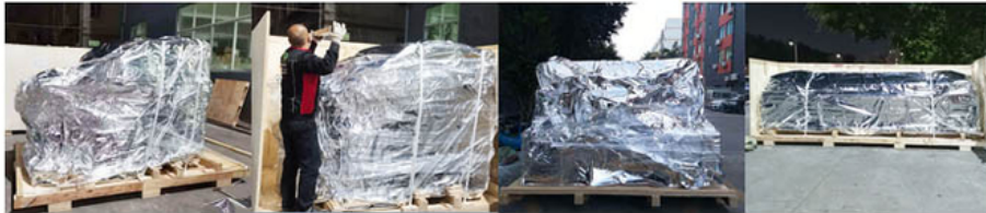
Step two: Vacuum packaging Vacuum packaging; put the desiccant in a vacuum bag to prevent moisture; use straps to secure the machine;