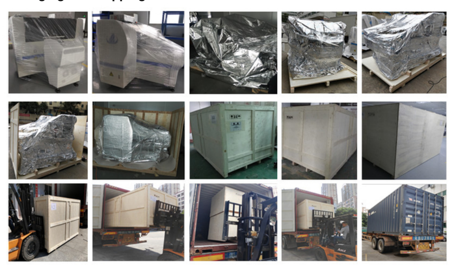
Step 1: The plastic film adheres tightly to the package and is moisture-proof