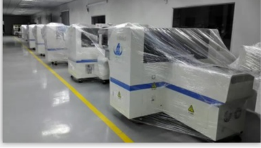
Complete packing, guaranteed with latest product display.