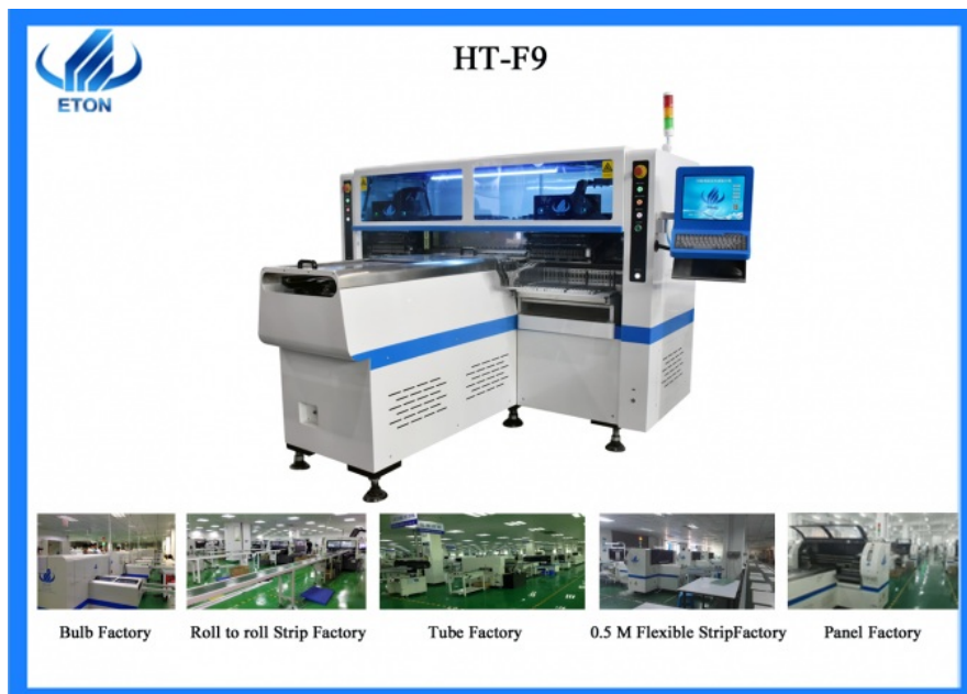
Technical parameter of pick and place machine ht-f9