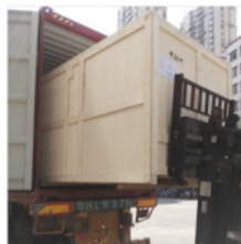
Step 3 Wooden box package

We pack the goods in vacuum wooden cases, which has the advantage of reducing the oxidation of the goods and ensuring their dryness.