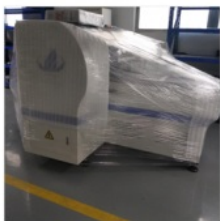
Step 1 Film packaging