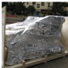
Step 2 Vacuum packing