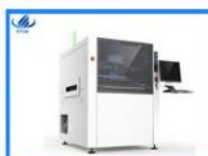
Automatic stencil printer