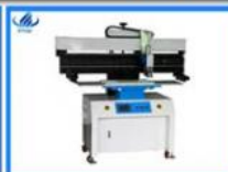
semi-auto stencil printer