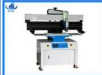
semi-auto stencil printer