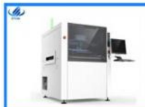
Automatic stencil printer