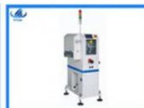
PCB cleaning machine