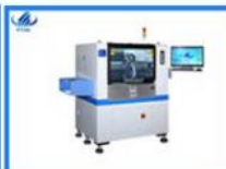
Glue Dispenser Machine