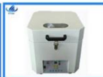
Solder paste mixer