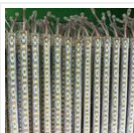
Flexible strip 1

Available for 5M, 50M, or any length of flexible strip and roll to roll.