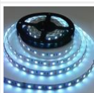
Flexible strip 2