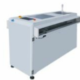
Double rail translation conveyor