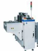
NG/OK double unloader