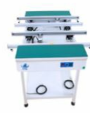
Double rail conveyor