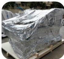
Unique tin foil packaging