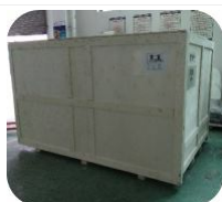
customized Strong wood carton packing