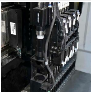
Mark camera Hikvision brand from China top one