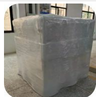
Add foam+film packaging