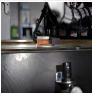
Grating scale Imported from UK RENISHAW