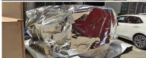
Step2: Vacuum paper packaging and moisture-proof bag, so that the machine can be kept dry during transportation to prevent moisture.