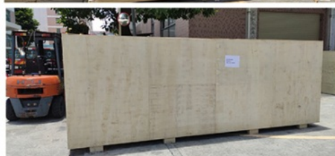
Step4: Each exported machine will be equipped with sturdy export wooden boxes, to ensure that the delivered product is good.