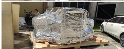
Step3: Use straps and triangular wood to fix the machine to prevent damage to the machine during transportation.