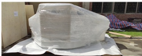
Step1: Wrap with stretch film to prevent the equipment from

Shipping: --- We ship to world wide from china mainland using air mail by EMS, UPS, DHL or TNT or as your request for parts. --- Sea shipping for machine.