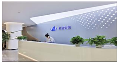
The hall of office building in Shenzhen

Rates as "China high-tech enterprise" "Shenzhen high-tech enterprise" etc.