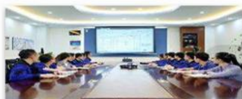
Excellent R&D team