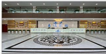
The hall of office building in Jiangxi