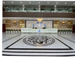
The hall of office building in jiangxi