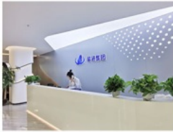
The hall of office building in shenzhen