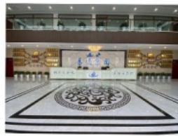
The hall of office building in jiangxi