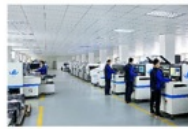
strict machine testing