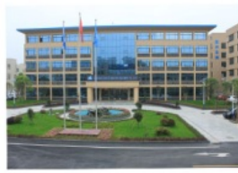
more than 300 employees