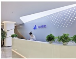
The hall of office building in shenzhen