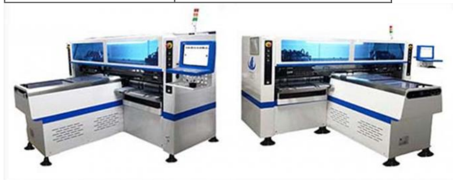
Different sides of machine HT-F9