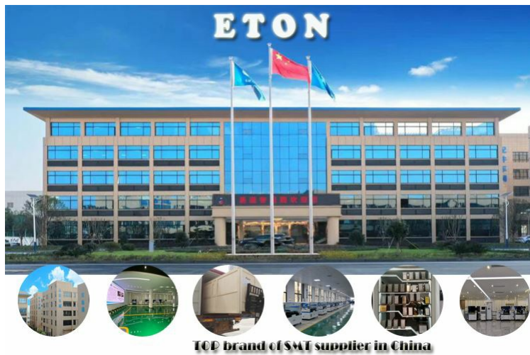
TOP brand of SMT supplier in China

ETON is China's largest manufacturer of SMT machine, industrial park more than 50000 square meters. -ETON got more than 14 years R&D experience in SMT industry equipped with core technology -ETON Got large more than 80% big led lighting industry market, machine hot sell to more than 20 countries. -ETON R&D Global first automatic stencil printer machine for roll to roll 100 m led strip light -ETON R&D super high speed pick and place machine, 250000 CPH, fastest in all over the world