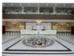
The hall of office building in jiangxi