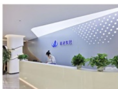
The hall of office building in shenzhen

ETON Industrial park: There is 5,0000 square meters modern intelligent industrial parks. Having more than 300 employees .Equipped with an advanced processing and manufacturing centers.There are various machine,the fastest capacity reached 250000CPH,which has broken world record.