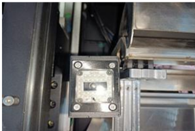
Nozzle debugging camera

This machine can produce 4 kinds of different materials at the same time, maintain high production speed and paste them without waiting at one time. Applicable to 0.6, 0.9m, 1.2m rigid lamp board and 0.5m, 1m soft strip light.