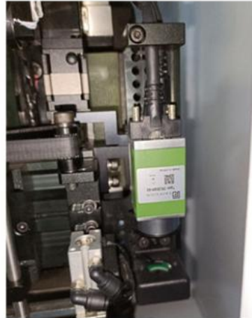
Feeder debugging camera