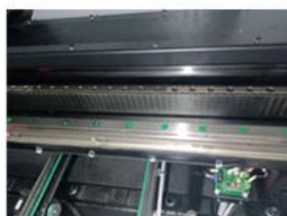
linear guide rail