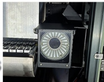
Flight recognition camera