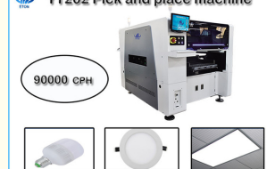
YT202 Pick and place machine