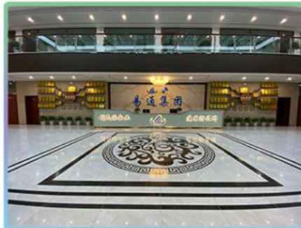
Hall of complex Building