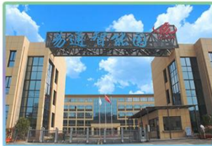
Gate of Jiangxi Industrial Park