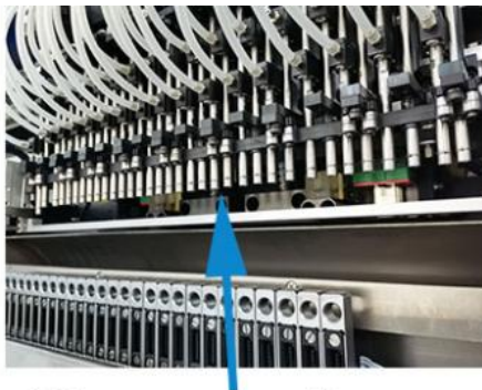
Close up of mounting head