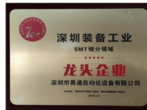
Leading enterprise award