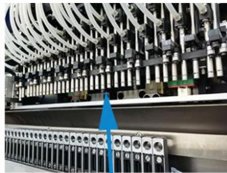
Close up of mounting head