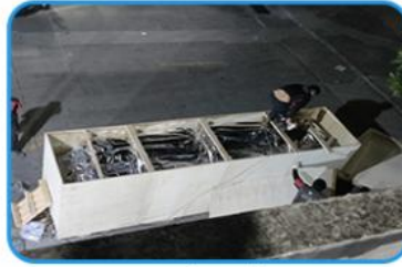
Step2: package with vacuum wooden box