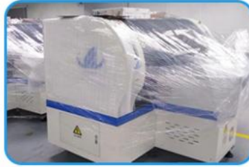
Step1: package with foam cotton