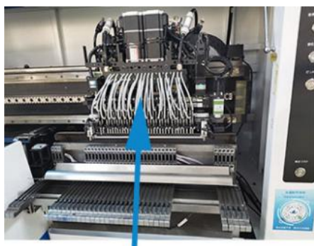
Suction nozzle rod

5 PCS cameras to ensure mounting accuracy.