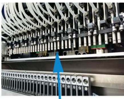
Close up of mounting head