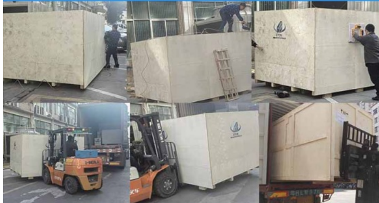
Step three: professional wooden box packaging