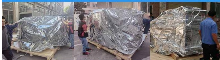
Step two: vacuum packaging; use strap to secure machine