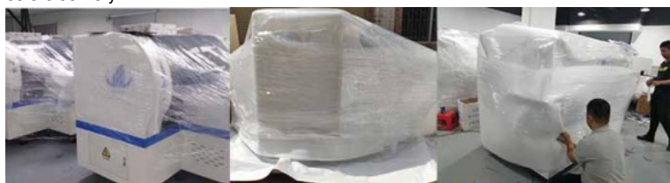
Step one: pack the machine with foam cotton stretch film

Delivery: 35-40 days after 30% T/T prepayment, buyer should come to inspect when we do test running, after testing, pay the 70% balance before delivery.