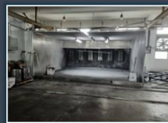
Powder Spraying Workshop Spraying the workpiece