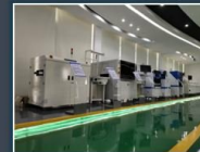
Full SMT line Solution Showroom