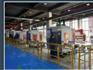
CNC workshop Powder Spraying Polishing