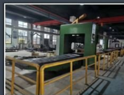
Boring&Milling Machine For rough machining of large parts