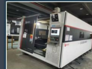
Laser Cutter Sawing the workpiece