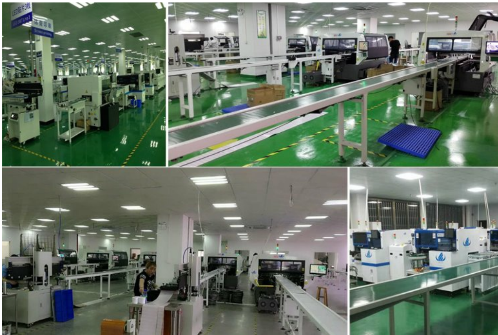
Customer's Factory, Honor customer for you!