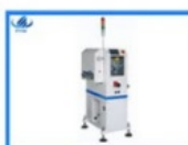
PCB cleaning machine