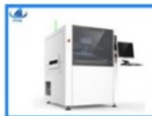
Automatic stencil printer