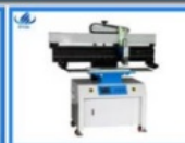
semi-auto stencil printer