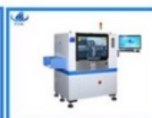
Glue Dispenser Machine