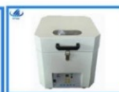
Solder paste mixer