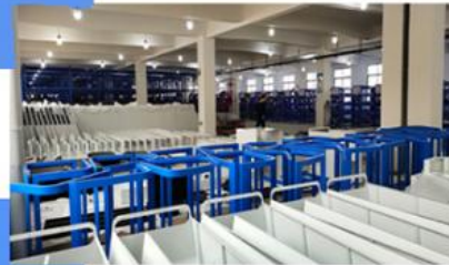
Rack placement library