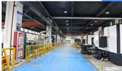
Sheet metal workshop