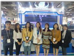
Professional Sale Team