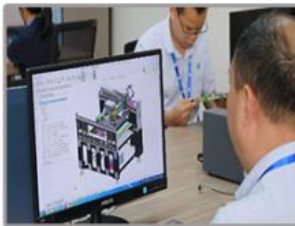
Excellent R&D Team