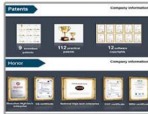
133 patent certificates