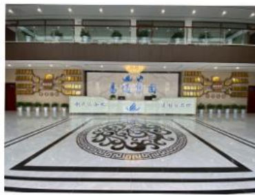
The hall of office building in jiangxi