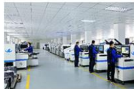
strict machine testing