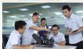
Core Technology Independent R&D