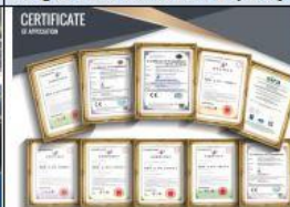
>135 Patents Invention& Software& Practical

Global Service Office: India · Turkey · Vietnam · Egypt · Pakistan