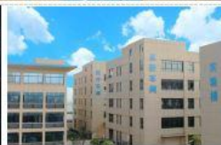
>52000M 2 Manufacturing Center