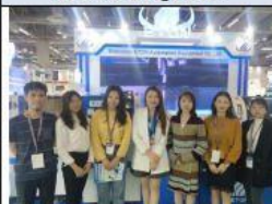
Rich Industry Experience Full SMT Line Solution Support