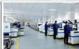
>100 sets/month Large-scale Production Capacity