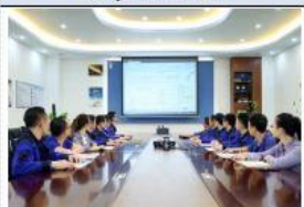
>500 Staffs China Top One in SMT Industry