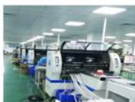
1m Strip Factory