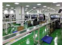
25m Strip Factory