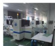
Panel light Factory