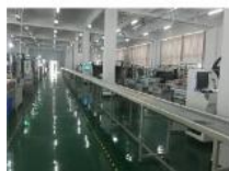
50m Strip light