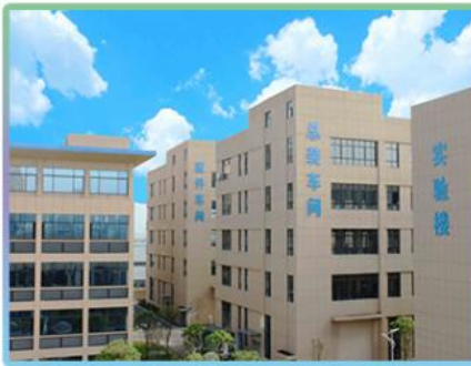
Production shop building