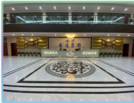
Hall of complex Building