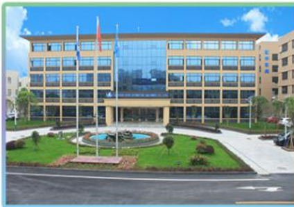
Panoramic view of complex Building