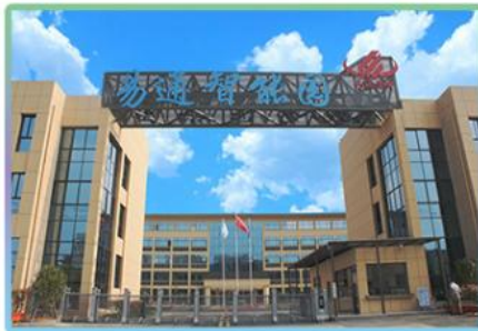
Gate of Jiangxi Industrial Park