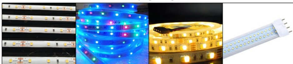
Flexible strip light, RGB, LED Tube