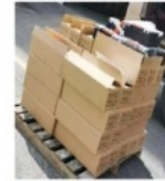
The accessories fittings packaged in box separate, easy to find everything.