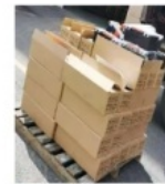
The accessories fittings packaged in box separate, easy to find everything.