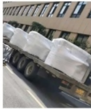
Factory transport by truck