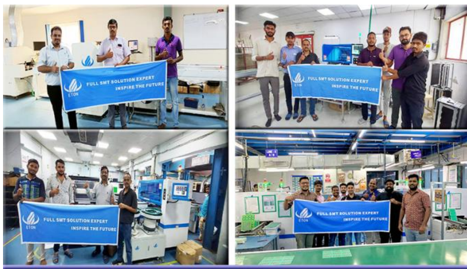
Customer group photo and customer factory