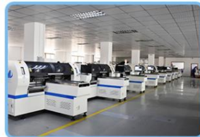
ETON assembly shop

Since its establishment in 2011, ETON has been committed to the development and production of SMT placement machines.