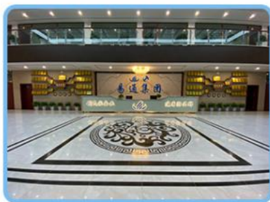
The hall of office building in Jiangxi