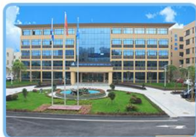
ETON Industrial Park