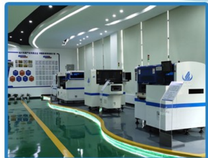
Global fastest machine, 250000CPH New world record.