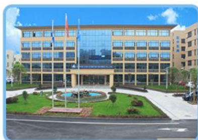
ETON Industrial Park