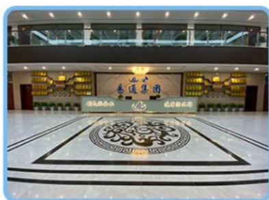
The hall of office building in Jiangxi