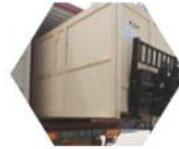
Third step: Load up the truck

All machines are packed with vacuum and wooden packing like the one in the pictures.