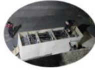
second step: 1.sealed vacuum bag 2.packing in wooden cases