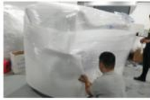
First step: Baled foam