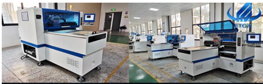
HT-E8S-1200 Optimal capacity:45000 CPH PCB size:1200*500 mm