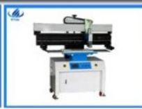
semi-auto stencil printer