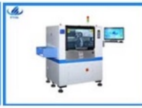
Glue Dispenser Machine