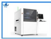
Automatic stencil printer