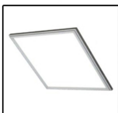
LED Panel light