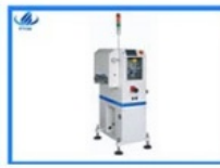
PCB clearing machine