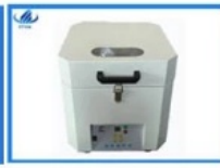
Solder paste mixer