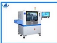
Glue Dispenser Machine