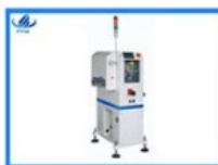
PCB cleaning machine