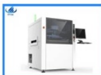
Automatic stencil printer