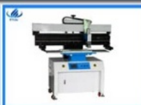
semi-auto stencil printer