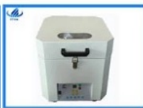
Solder paste mixer