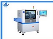
Glue Dispenser Machine