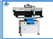
semi-auto stencil printer