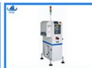
PCB cleaning machine