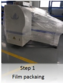
Step 1 Film packing