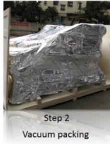
Step 2 Vacuum packing